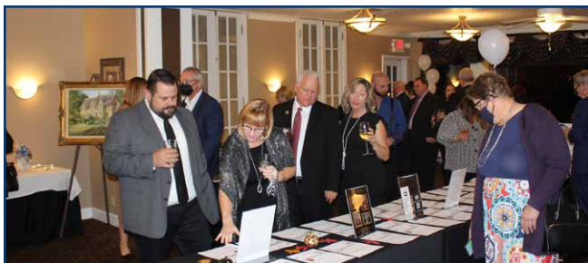
Educational Foundation Celebration attendees browsed and bid among the dozens of silent auctions items on display at the event.